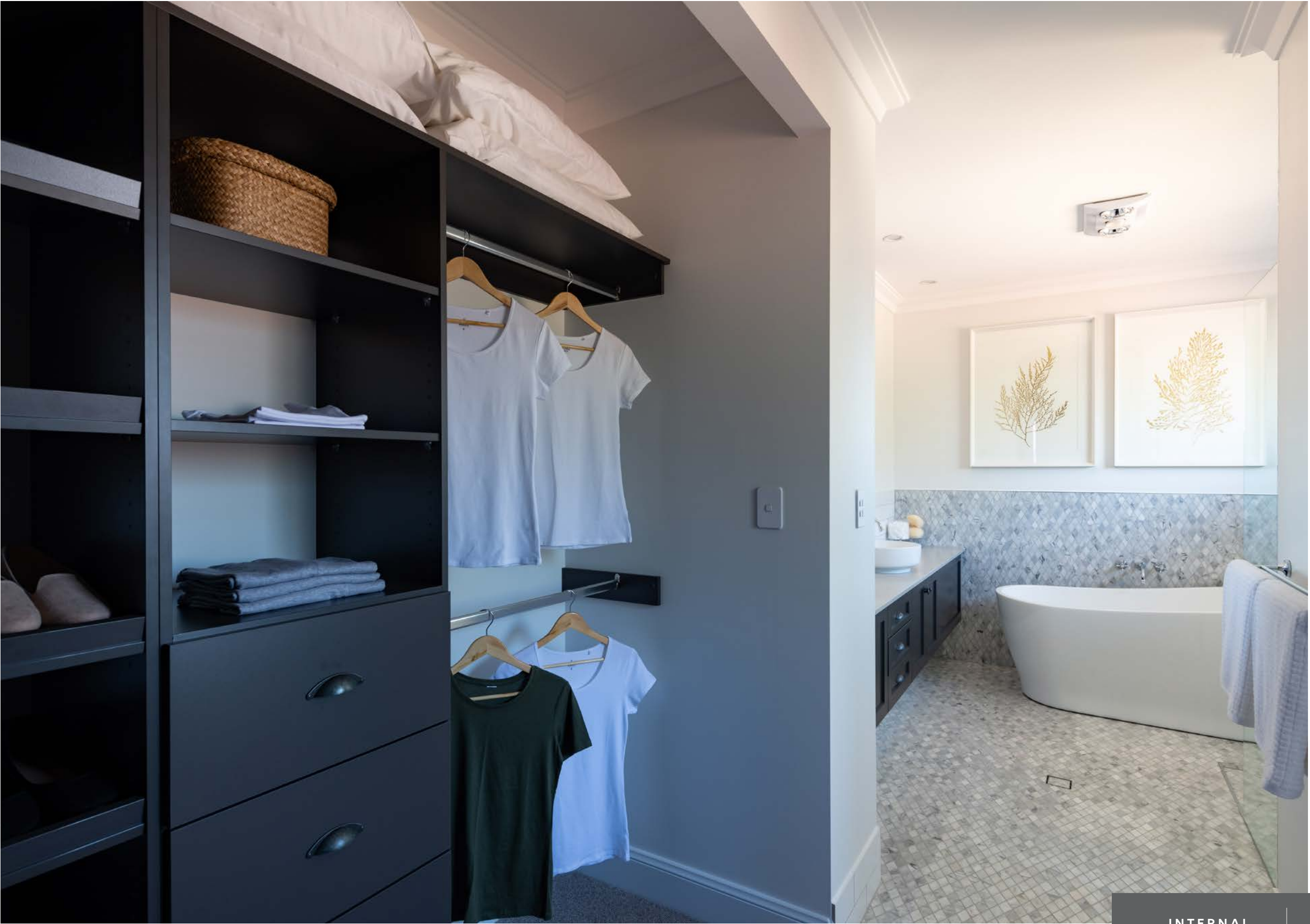
All images are for illustrative purposes only. They feature upgrades and items that are not standard inclusions.