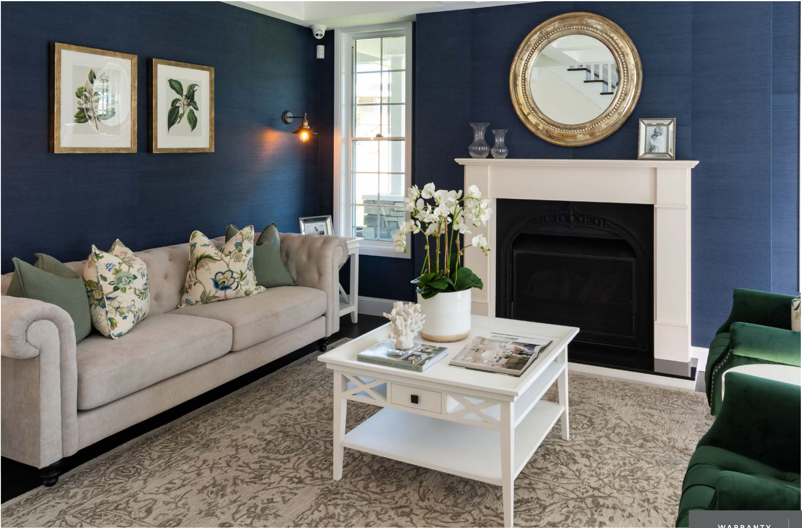
All images are for illustrative purposes only. They feature upgrades and items that are not standard inclusions.

McCarthy Homes reserves the right to alter the above-mentioned inclusions due to availability and/or product development.